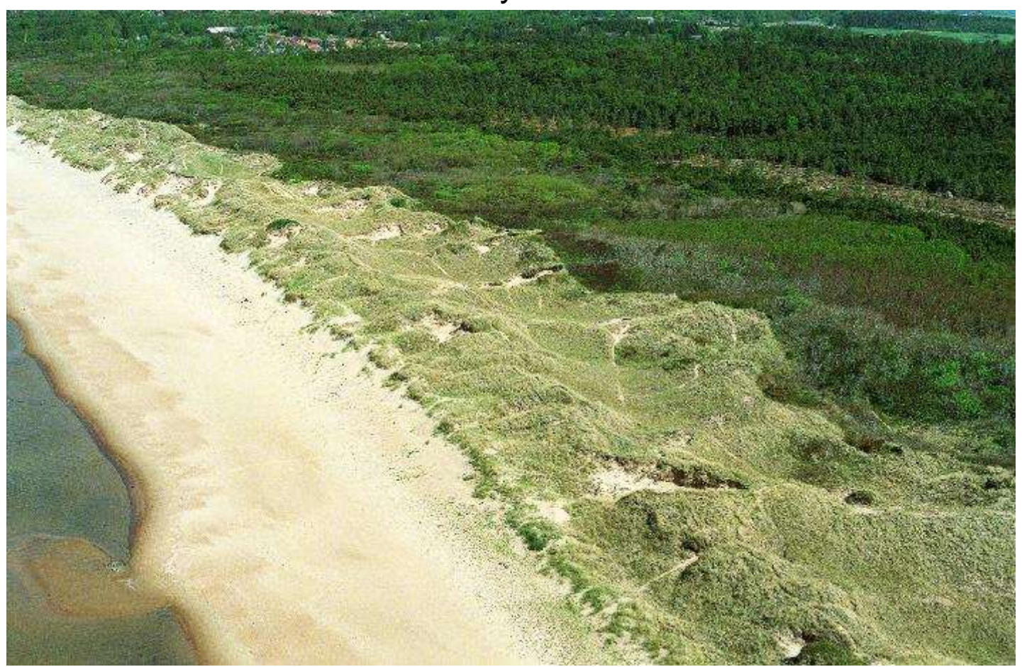
Haverdals Natura 2000 area. Photo from 2002