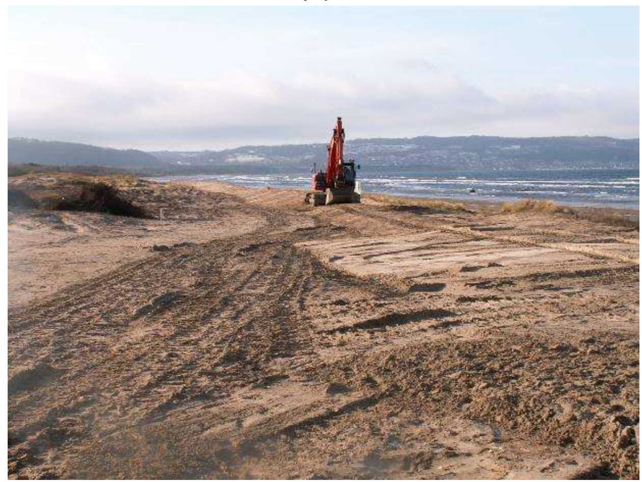
Utvald Miljö. Skummeslöv Södra NR. Photo 2006 during restoration