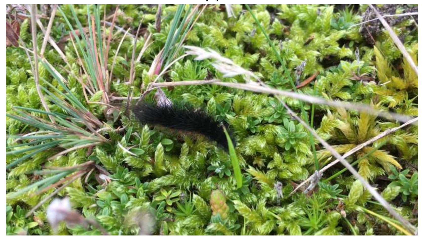
Utvald Miljö. Skummeslöv Södra NR. Video october 2017 – Larvae of Brown tiger moth