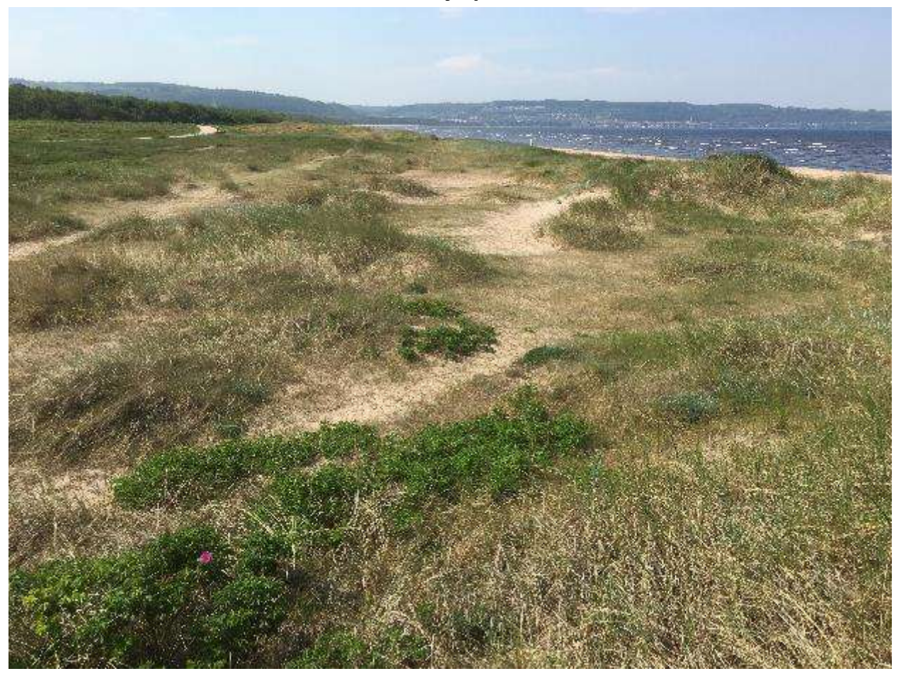
Utvald Miljö. Skummeslöv Södra NR. Photo may 2018